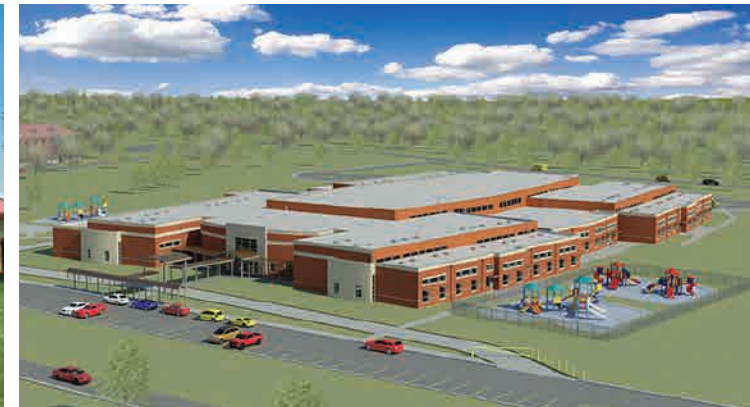
KINGSOLVER-PIERCE ELEMENTARY SCHOOL FORT KNOX, KENTUCKY