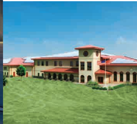
ARMY RESERVE CENTER WEST PALM BEACH, FLORIDA

As our military moves to a lighter, faster, and more intelligent force, we've built a reputation for modernizing military facilities into safer, more secure, and more sustainable spaces. Our designs for administrative, training, operations, headquarters, and mission and community support facilities enable seamless day-to-day operations while incorporating the latest advances in technology and sustainability. We're also leading the design of 21 st Century Schools, creating innovative and collaborative learning environments for the children of our forces.