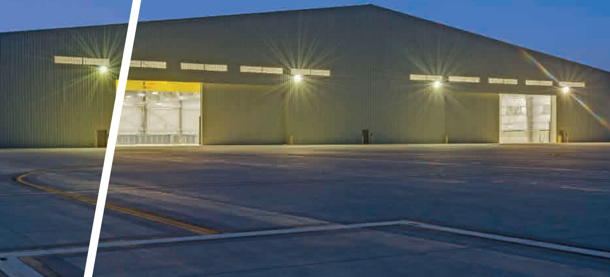
UNMANNED AIRCRAFT MAINTENANCE FACILITY FORT HOOD, TEXAS

Our teams have provided Federal Title I and Title II services for airfields, hangars, and related support facilities on military installations across the globe. Understanding the most important function of airfields and hangars is the ability to maximize an aircraft's capabilities, we offer innovative solutions coupled with expert knowledge in applying Department of Defense criteria. Our experience ranges from simple shade structures that protect an aircraft from the elements to more complicated, environmentally controlled maintenance facilities, as well as airfield paving and lighting.