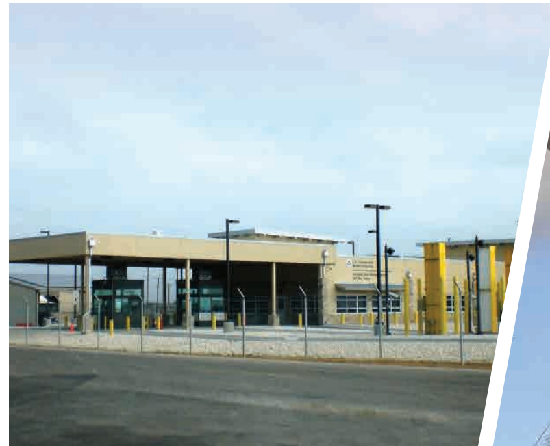
LEED GOLD CERTIFIED LAND PORT OF ENTRY AMISTAD DAM, TEXAS